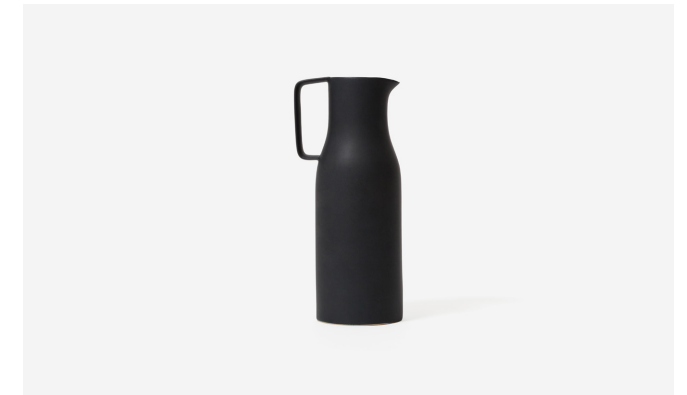
MILLE MILK JUG