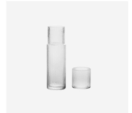
MERINO CARAFE SET