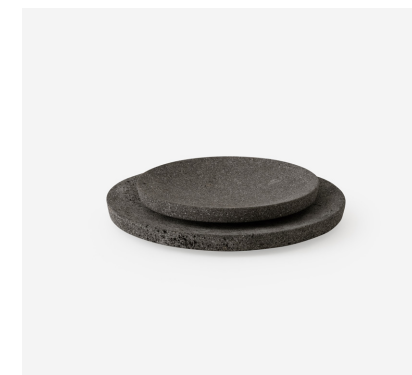
BATU DISPLAY PLATES