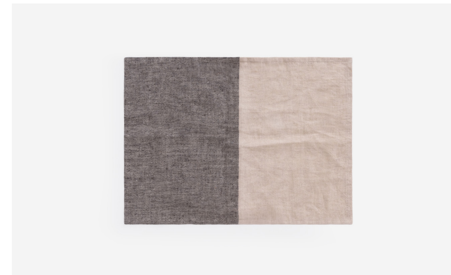
LARGO LINEN PLACEMAT