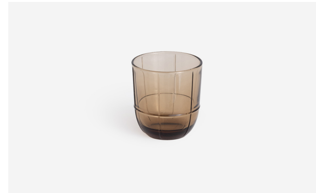
VERONA TUMBLER GLASS

The holidays have a remarkable ability to make magic feel within reach. This season, lean into the charm and set the mood for connection with thoughtful touches that help the evening flow.